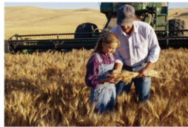
▲ Agricultural & Environmental Protection