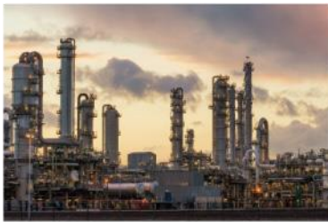
▲ Petrochemical & Chemical Industry