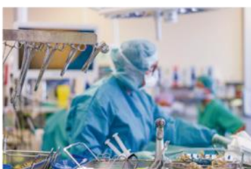
▲ Food & Pharmaceutical Industry