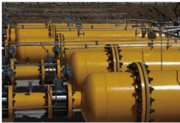
▲ Municipal Engineering & Utilities