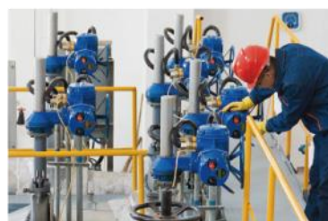
▲ Other Industries